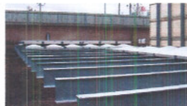
Supply and installation of new steel supports