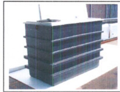
ONE-PIECE TANK WITH HORIZONTAL SPLIT