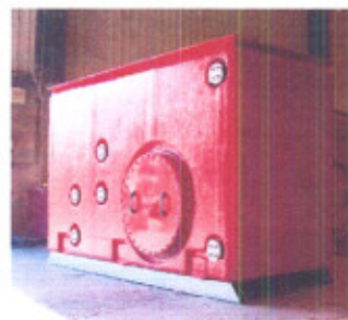
5000 L CHEMICAL HOLDING TANK